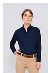
SOL'S EXECUTIVE 16060