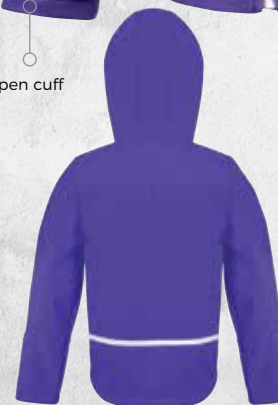
Fashionable shaped longer back panel with reflective detail